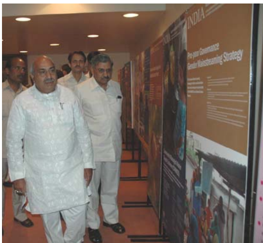
Mr. Ishwardas Rohani, Speaker, Madhya Pradesh Legislative Assembly visited the exhibition on Water for Asian Cities Programme

UN-HABITAT organized an exhibition of activities of UN Agencies in Madhya Pradesh as a side event on the occasion of launching of Legislator's forum for Human Development at the Madhya Pradesh Legislative Assembly on 29th March, which was inaugurated by the Hon'ble Speaker, Madhya Pradesh Legislative Assembly. Exhibition on initiatives under the WAC programme was dedicated to pro-poor water and sanitation governance in India, Nepal and other least developed countries in the Mekong region. Emphasis was on community based water supply and sanitation projects in small and medium