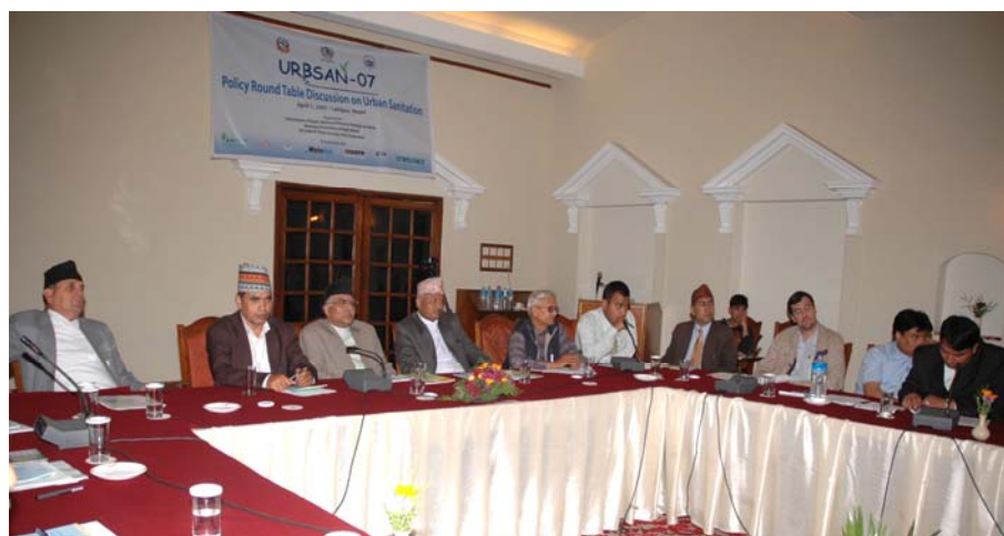
Delegates attending the Round Table Discussion during the National Workshop on Urban Sanitation (URBSAN '07)