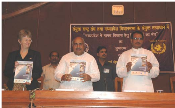
Hon'ble Speaker, Madhya Pradesh Legislative Assembly, Chief Minister of Madhya Pradesh & UN Resident Coordinator releasing UN-HABITAT publications

Implementation plan" for the cities of Indore and Bhopal were also released by the Hon'ble Speaker and the Chief Minister. These strategy documents have been prepared by WRP of South Africa and TERI of India on the basis of water balance analysis, which revealed that there was considerable loss of water during intake, treatment and transmission. This Non-Revenue Water (NRW) ranged between 31% and 60%. The distribution network on a GIS maps have also been included in the strategy documents. Based on the study, city specific strategies have been developed to minimise the water losses and to increase the revenue for the municipal corporations.