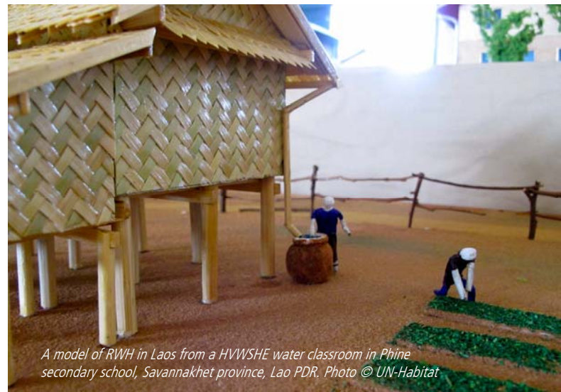
A model of RWHS in Laos from a HVWSHE water classroom in Phine secondary school, Savannakhet province, Lao PDR.

The new project is due to commence in the summer of 2011 and project documents will be signed with the local water utilities in Khamouane and Savannakhet provinces.