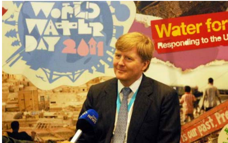
His Royal Highness, Willem-Alexander, Prince of Orange, the Netherlands at the World Water Day Convention 2011 in Cape Town, 22 March 2011.

Joan Clos also delivered an address from the UN Secretary General Ban Ki-moon, stating that without water there is no dignity and no escape from poverty. However, he underscored that the achievement of the MDGs on water and sanitation lags behind, with an increase of 140 million more people with-