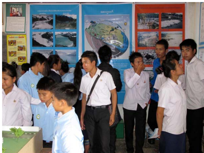
Students exploring the HVWSHE classroom at Phine secondary school.

Sample lesson plans have been developed for different school grades. All materials have been translated into Lao and adapted into the local context. The main topics for the lower grades include "Clean and healthy food", "Water is life", "Clean body", "Toilet" and "Bacteria, virus and sickness". For the older children the scope of these topics will be further expanded. The children have also participated in the development of the teaching materials by drawing pictures for the publications. The methods of teaching and learning include not only books and posters but also songs, poems, stories and special hands-on