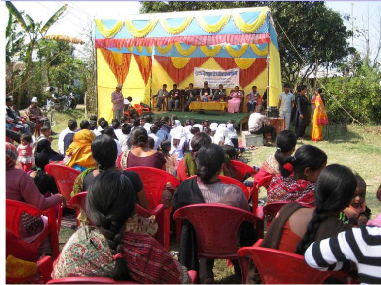
ODF declaration in Dipendranagar, Gulariya Municipality

In addition, the project also adopted an integrated approach in order to improve environmental health condition of urban poor communities by focusing on household water treatment, waste management, sanitation, indoor air pollution and hygiene. To improve sanitation, it is promoting low cost improved pit latrine, urine diverting ecosan toilets and biogas attached toilets. Most of the constructions were done using the local materials and local labours to create a sense of ownership and support local livelihoods. To demonstrate the