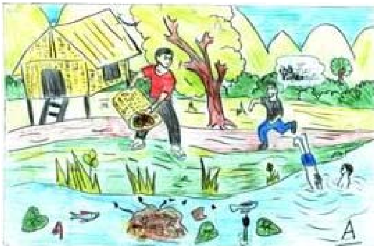
A child's drawing highlighting the dangers of pollution at a HVWSHE-themed arts class.

The 32-hour course unit consists of five chapters including water supply management and scenarios of adaptation to the Climate Change. The new course was first introduced in 2010 and is received well by the 4th year students, who are encouraged to pass on the messages to communities outside the lecture room, especially when they enter the working life upon finishing their studies.